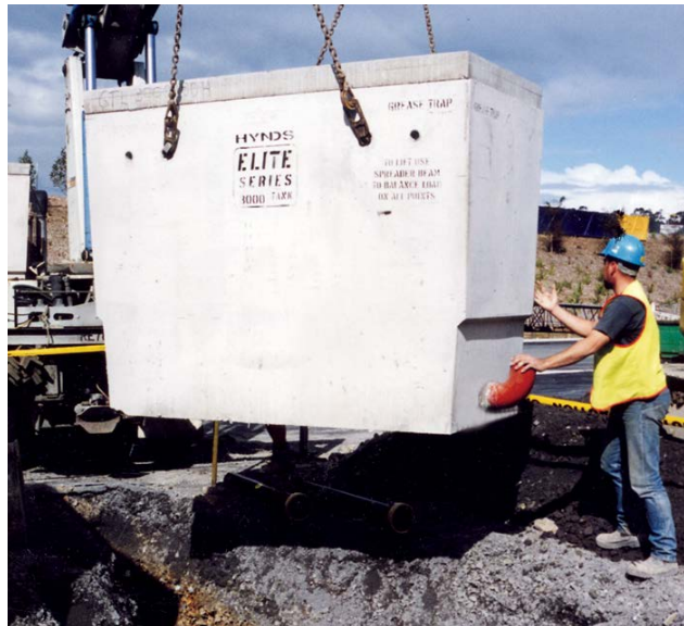
FIG. 1 Grease trap being placed on site