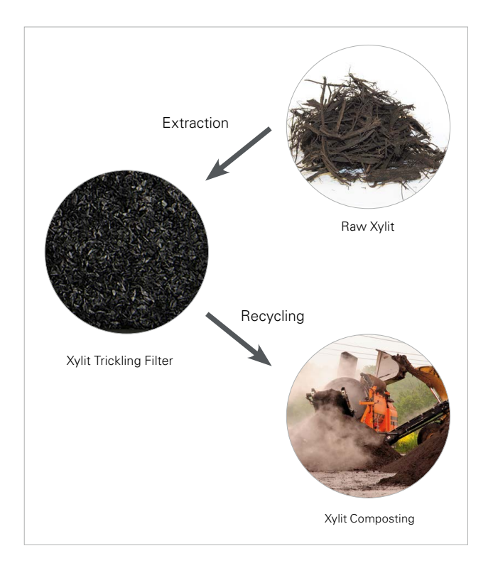
FIG. 1 Xylit

The Xylit offers very reliable treatment, especially during fluctuating or infrequent occupancy. Ideal for holiday homes. The natural properties of the Xylit maintains biological activity for long periods without intervention. The unique potential of the Xylit makes the X-Perco a dependable choice for sustainable wastewater treatment.