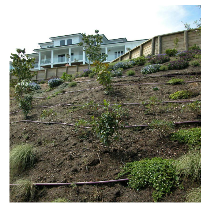
FIG. 2 Drip irrigation pipe prior to bark being laid.